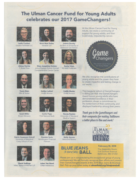
GameChangers featured in the Baltimore Business Journal in 2017