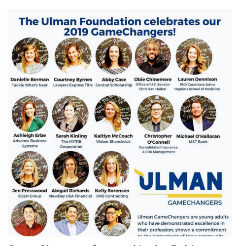
GameChangers featured in the Baltimore Business Journal in 2019

"The GameChangers program was such a great experience. Mixing service and fundraising with professional development is a great way to meet people and make new connections. I got to meet other change makers in the Baltimore community and learn more about the organization's efforts. Thank you for this experience!"