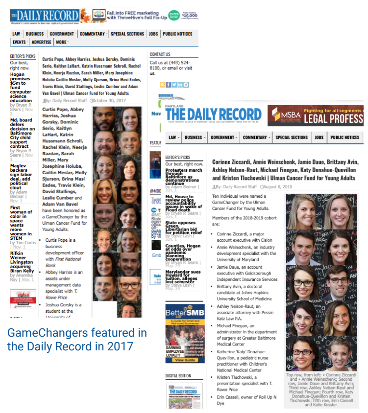
GameChangers featured in the Daily Record in 2018